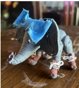
(g)