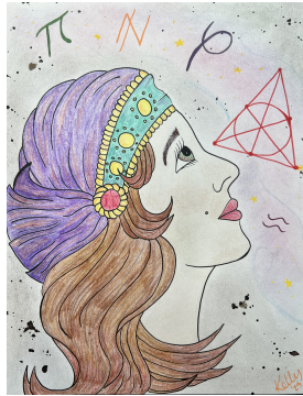
(b)