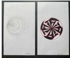
(d)