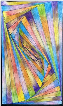
(a)