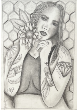
(f)